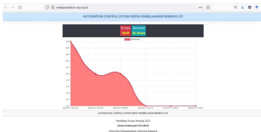
Figure 7. Internet Of Things (IoT)-based Automation Control System Display

Figure 7 shows the display of time and display of moisture levels in the soil which were measured during the practicum process for SMK 3 Sidrap students.