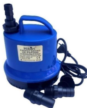
Figure 5. Water pump

The purpose of the LCD is to display data, letters, characters, or images. This LCD has good resolution, is thin, and runs a little warm. Especially in electronic products such as TV screens, mobile phones, laptops, PCs, and notebooks, LCDs have been used in various industries.