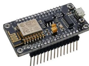
Figure 1. MCU nodes

The results obtained in this study are an overview of the results of practicum activities for measuring soil moisture levels carried out by subject teachers and students at SMK Negeri 3 Sidenreng Rappang on the subject of measuring soil temperature and moisture. Next, the subject teacher fills out an observation sheet on the successful implementation of the practicum carried out using an Internet of Things (IoT)-based Automation Control System. Practicum activities using an Internet of Things (IoT)-based Automation Control System are carried out to see and know the entire series of practicum activities starting from the preparation, implementation, and results stages, work attitude, and practicum working time. The practicum is carried out by utilizing an Internet of Things (IoT)-based Automation Control System. Practical implementation of measuring water content in soil requires NCU Nodes, humidity sensors, Arduino relays, LCDs, and water pumps to be assembled so that they become practical learning media.