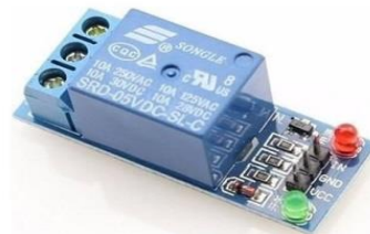
Figure 3. Arduino relays

A specific type of sensor that measures soil moisture by detecting the wetness around the soil.