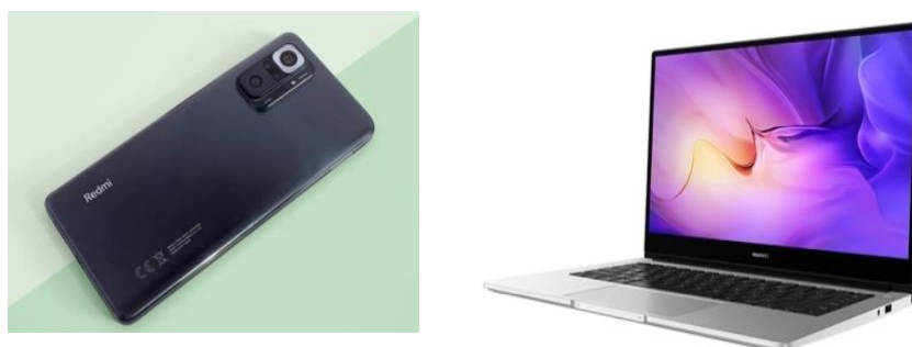
Figure 6. Smartphones and Laptops

Furthermore, there is a smartphone or laptop to access soil moisture levels via internet access. However, to create an Internet of Things (IoT)-based Automation Control System learning media, a Cloud Server learning media is also needed which will store all files and data so that it can be accessed by everyone via the internet, as well as a qualified internet connection. To access practicum content on computers or smartphones, teachers and students can be accessed at http://media.Televisium-accs.my.id/