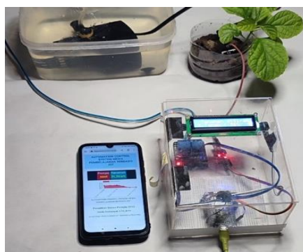
Figure 8. Internet of Things (IoT) based Automation Control System learning media display

Figure 7 shows the display of time and display of moisture levels in the soil which were measured during the practicum process for SMK 3 Sidrap students.